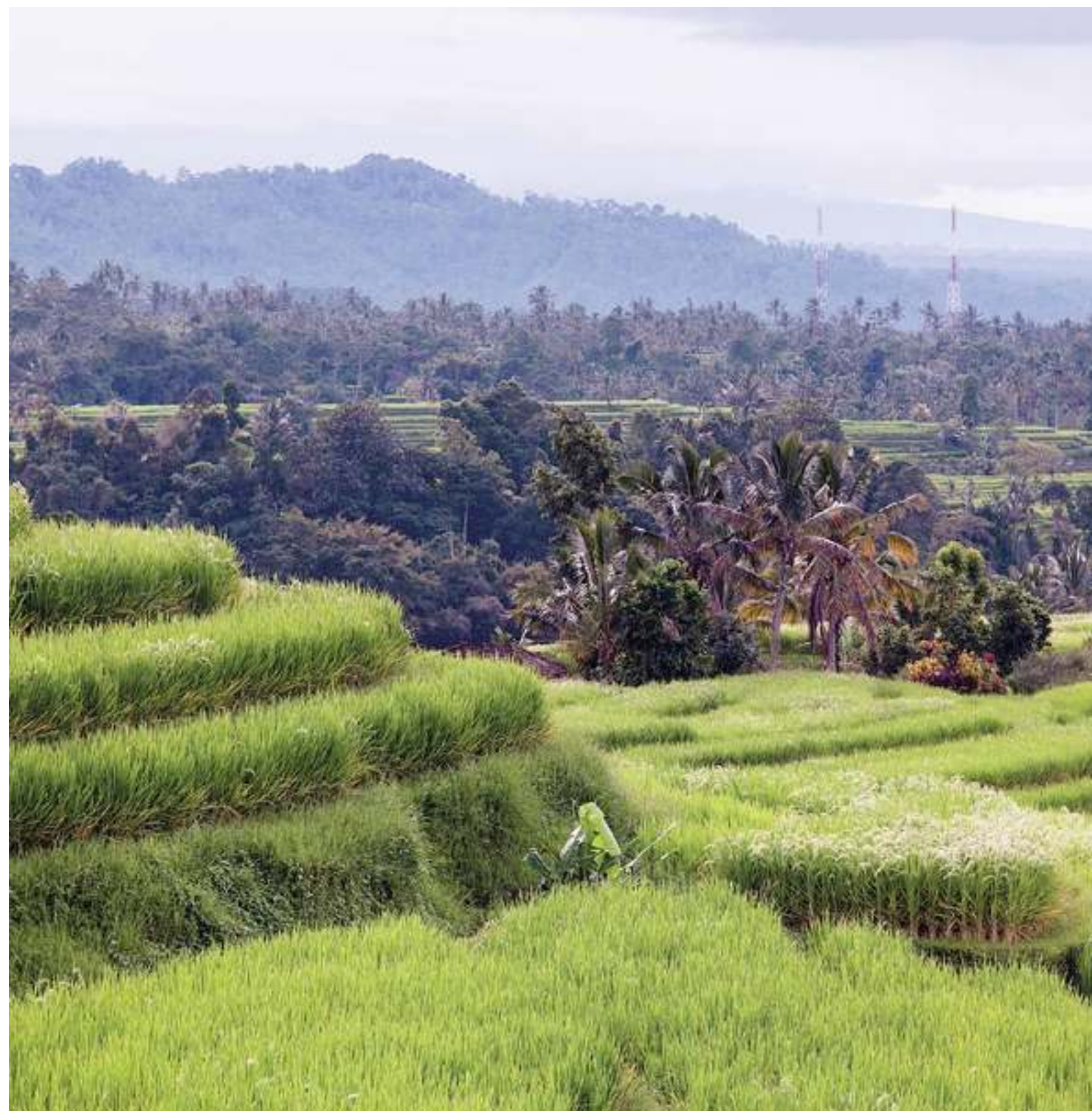
Balinese landscape.