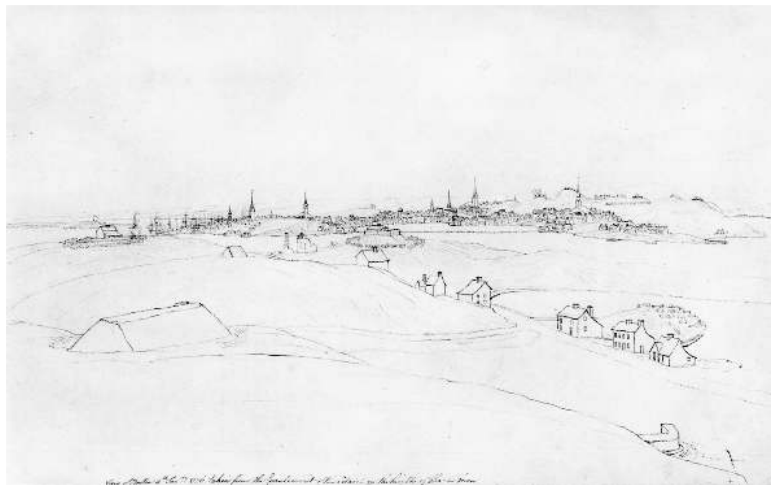
View of the town of ... taken from the ...